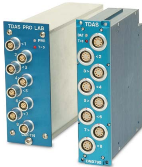
TDAS PRO LAB SIM and TDAS PRO SIM (13.7 x 12.2 x 3.4 cm) are standalone data recorders with 8 fully-programmable sensor input channels that work with a variety of sensors.