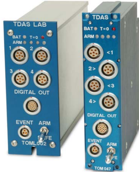
TDAS PRO LAB TOM and TDAS PRO TOM are standalone data recorders that independently fire up to 4 squib channels.

The TDAS PRO Timed Output Module (TOM) from DTS generates precise, high-energy firing signals for a wide variety of squibs used in air bag and pretensioner testing. The system also generates isolated digital outputs often needed to initiate or synchronize other events in the test lab. The TDAS PRO TOM includes 16-bit analog recording of squib voltage and current waveforms.