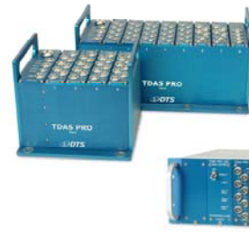
Fits in TDAS PRO 4- or 8-module rugged rack.

Available in 2 models: TDAS PRO crashworthy, TDAS PRO LAB stationary